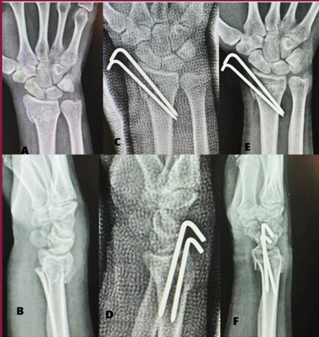
Figure 1. A 27-year-old female patient. A/B: Preoperative, C/D: After 2 weeks of operation, E/F: After 6 weeks of operation Pa and Lateral wrist X-ray